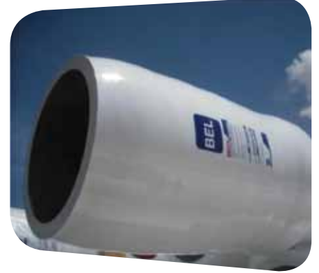
BEL 16" vessels for Sorek SWRO plant

The end result is a system that will not be subject to any internal corrosion at the sealing portion of the end plate, and is the safest system in the industry