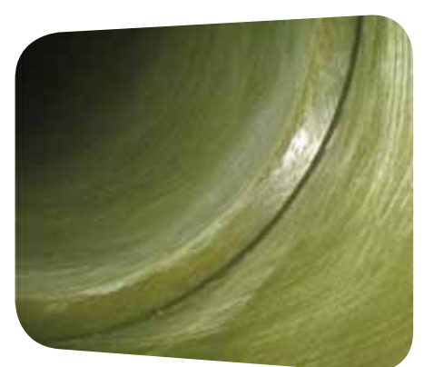
steel free lockers groove

during the production process. The end result is a system that will not be subject to any internal corrosion at the sealing portion of the end plate, and is the safest system in the industry.